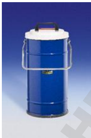
Dewar flasks 30/4 to 32 C with handle