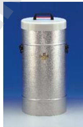
Dewar flasks 33 to 35 CAL with side grips