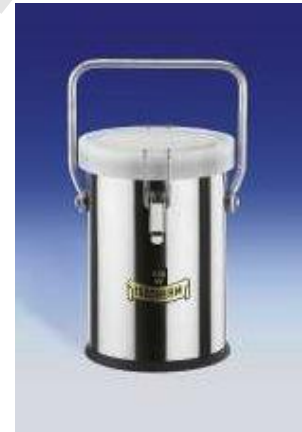
Dewar flask 26 B-E