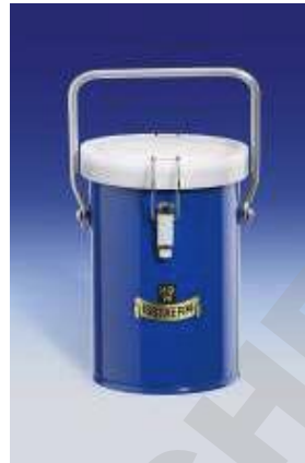
Dewar flask 26 B