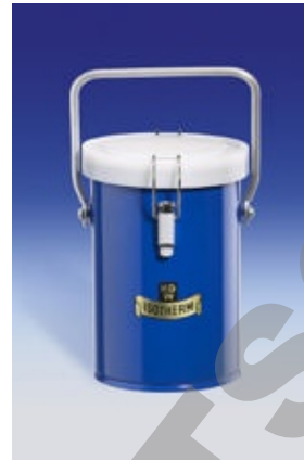
Dewar flask 26 B