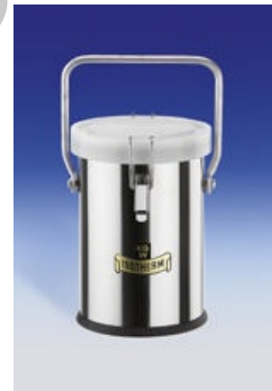
Dewar flask 26 B-E