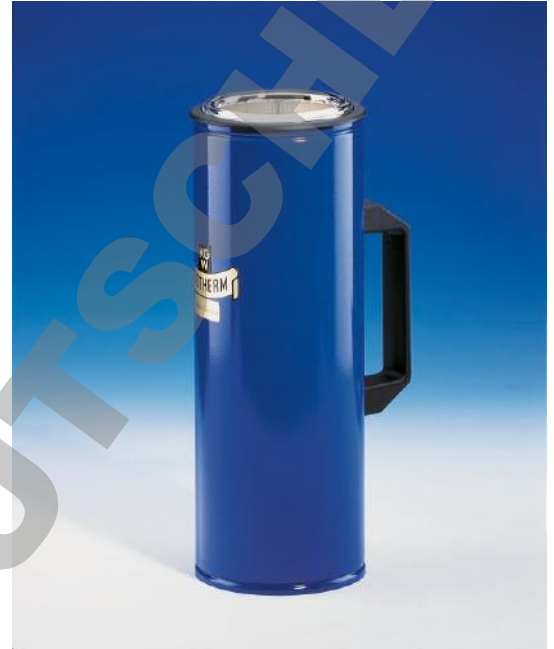
Dewar flask G 9 C