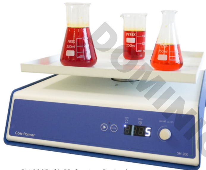
SH-200D-GL 3D Gyrotory Rocker Large