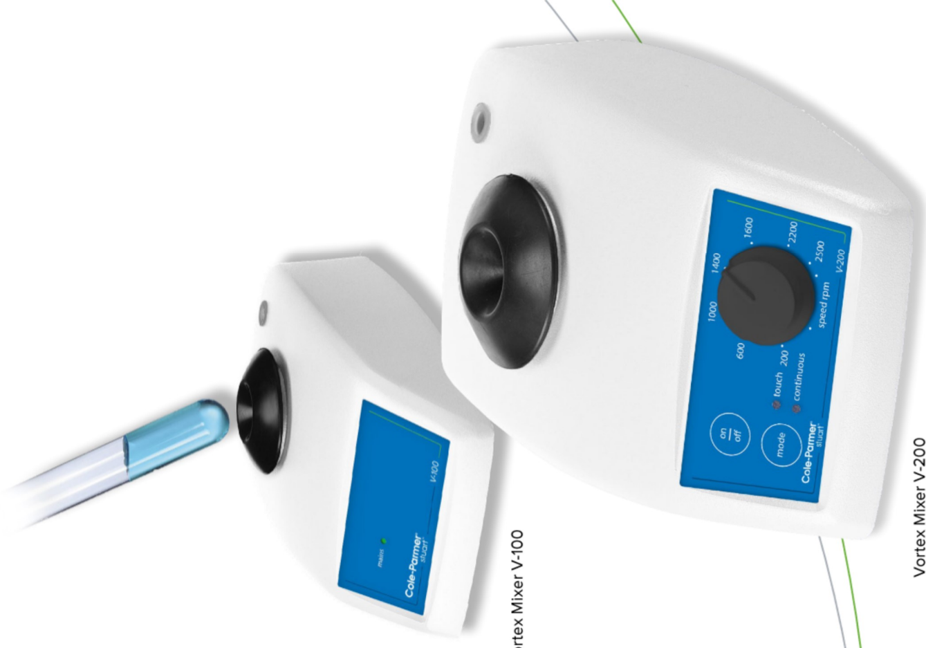
Vortex Mixer V-100