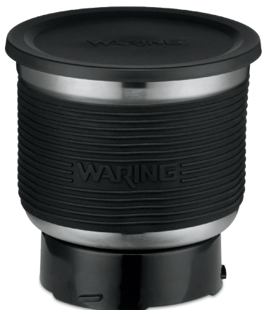
CAC128 Stainless Steel Bowl with Lid