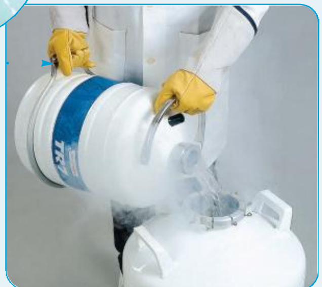
Tipping handle C