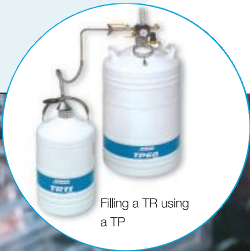
Filling a TR using a TP