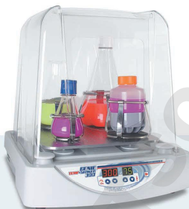
Standard Flask Clamps

Provides the flexibility for using a mix of different size and shape vessels or large volume on a single platform.