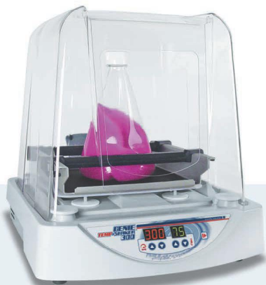
Universal Ratcheting Clamps

Access samples 3 ways - Door, Kickstand (back, left, or right) or Removable Cover