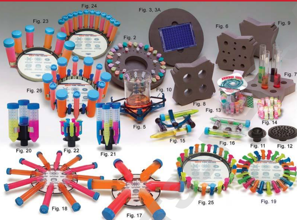
Fig. 1 Model H301 Multiple Sample Starter Set

Accessories for all Vortex-Genie® 2 mixers and Vortex-Genie® Pulse