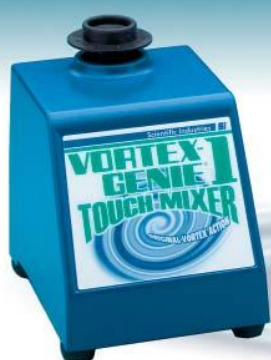
HIGH SPEED MIXER