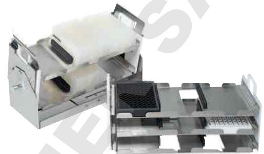
Microplate Rack Inserts

Our Microplate Rack Inserts are available for the Dedicated Adjustable Angle Test Tube Rack Holder (50 ml)-No. 600079 and the Universal Adjustable Angle Test Tube Rack Holder-No. 600088. You can increase your microplate shaking capacity, shake deepwell format plates at an angle, and remove many plates from the shaker at once for quick and easy transport to your benchtop.