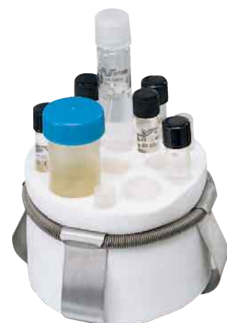
Vial/Tube Inserts for 1 Liter flask Clamps

The single and dual shaker stands place the stackable shakers at a convenient working height. No stand is required for units stacked three high.