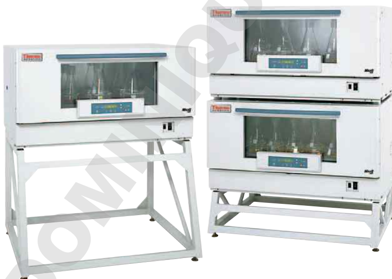
Stands for Stackable Shakers

The single and dual shaker stands place the stackable shakers at a convenient working height. No stand is required for units stacked three high.