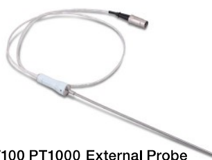
PT100 PT1000 External Probe