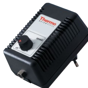
Cimarec i Standard Telemodul Controller