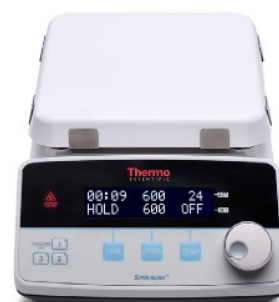
Super-Nuova+ Stirring Hotplate

Includes: PT100 Temperature probe, supporting rod and clamp kit (only for hotplates and stirring hotplates); Stir bar (only for stirrers and stirring hotplate)