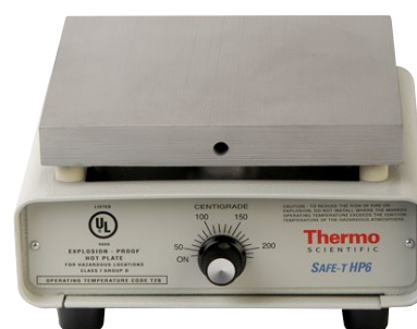
Explosion-Proof SAFE-T HP6 Hotplate

Includes: Stirrer unit and one 2 x 0.38 in. (5 x 1cm)