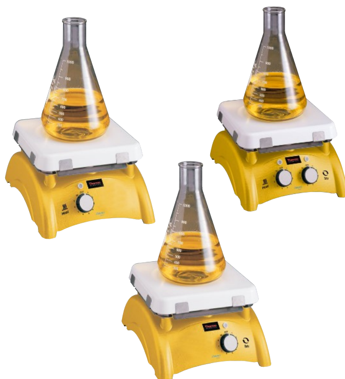
Cimarec Basic Hotplate and Stirring Hotplates