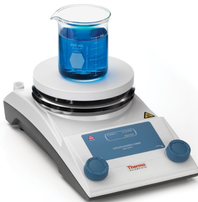
RT2 Basic Hotplate Stirrer

Optional: Non-slip heating bath, transparent shield and supporting rod