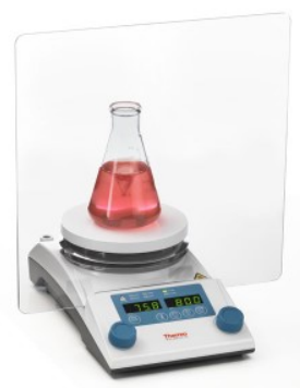
RT2 Digital Hotplate with transparent shield