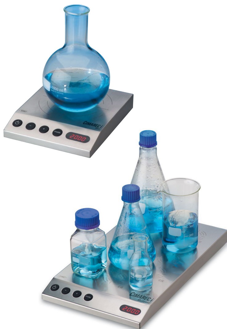
Cimarec i Magnetic Stirrers