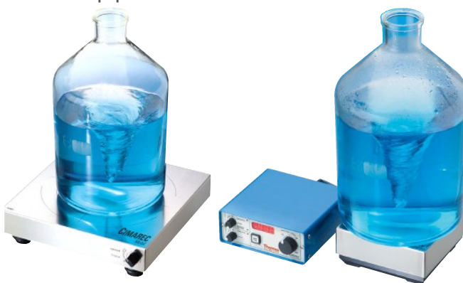
Cimarec Mobil Direct Stirrers