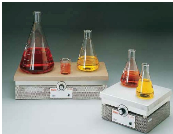
2200 Series Aluminum Top Hotplates

Alert: Recommended for use with glass vessels only