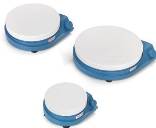
RT Basic Series Magnetic Stirrers

Certifications: cCSAus (100-120V models), CE (230V models), RoHS Compliant