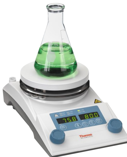
RT2 Digital Hotplate

Optional: Non-slip heating bath, transparent safety shield