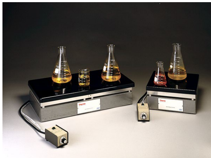
Large External-Controller Hotplates