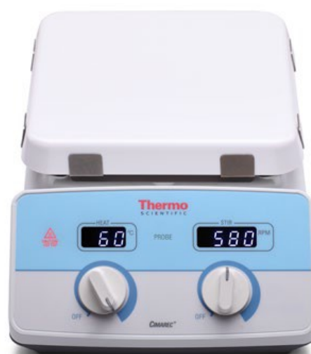
Cimarec+ Digital Stirring Hotplate

Includes: Stir bar (*only for stirrers and stirring hotplate models)