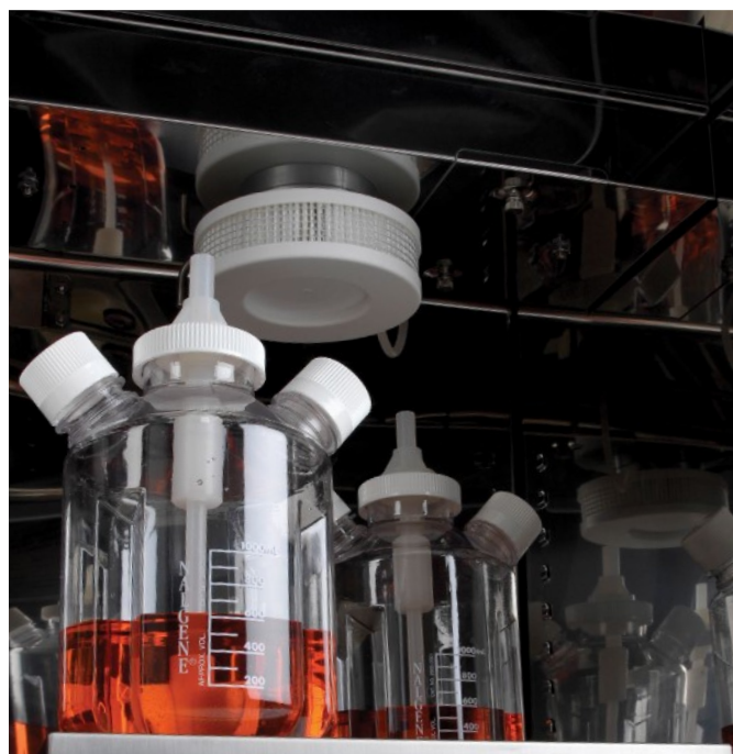
Cimarec i Biosystem Slow Speed Stirrer

Operating conditions: -10 to +56°C at 100% rH; 100-240V units contain a cord set with various plugs