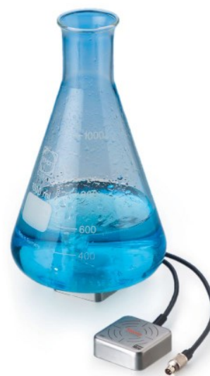
Cimarec i Micro Stirrer