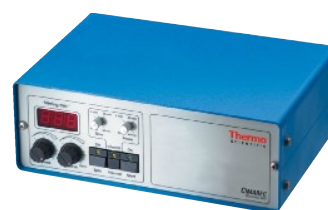
Cimarec 40B Telemodul Controller