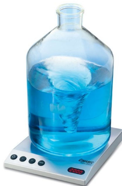
Cimarec Power Direct High Capacity Stirrer