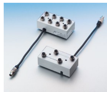
Cimarec i Benchtop Distributors