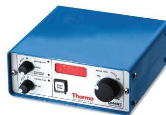
Cimarec 40M and 80M Controller