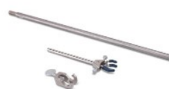
Supporting Rod and Clamps