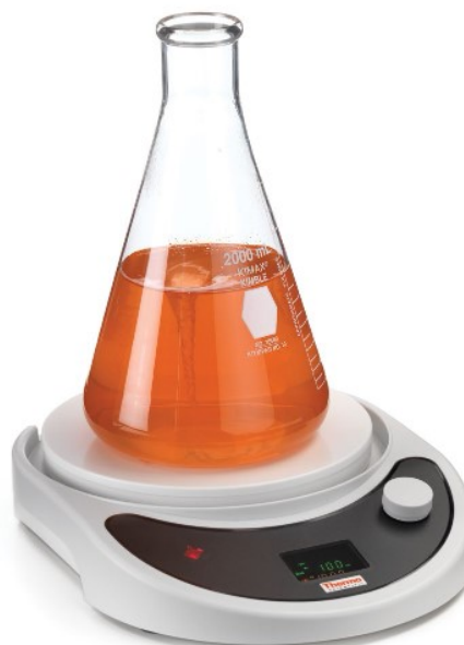
RT Touch Series Magnetic Stirrer

Includes: Stir bar and two non-slip silicone plate covers (1 black, 1 white)