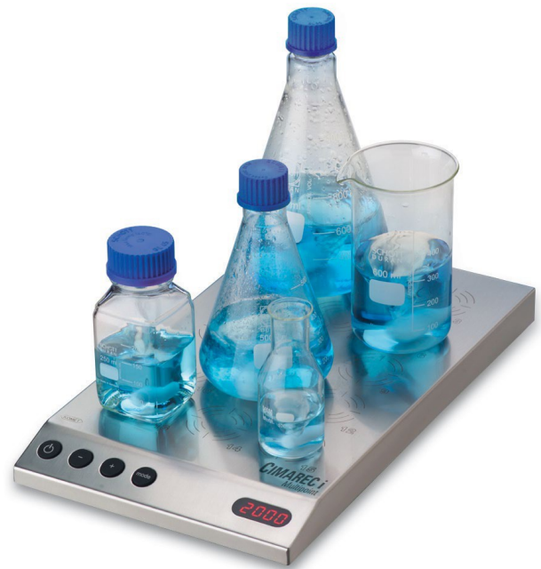
Cimarec i Multipoint 15 Stirrer

Operating conditions: -5 to +40°C at 95% rH; 100-240 V units contain a cord set with various plugs