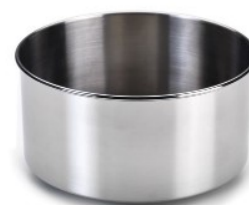
Heating Bath for RT2 Digital Hotplate