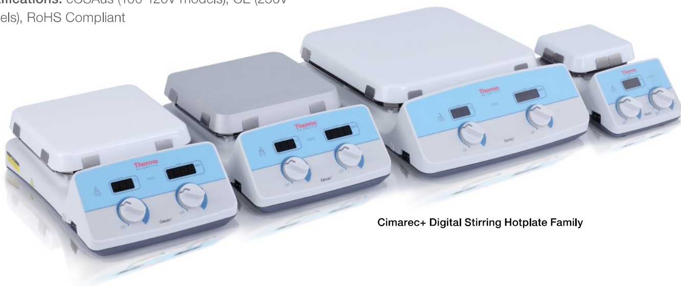
Cimarec+ Digital Stirring Hotplate Family

Certifications: cCSAus (100-120V models), CE (230V models), RoHS Compliant