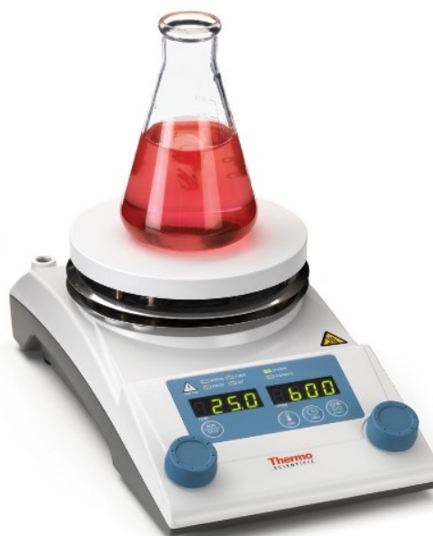
RT2 Advanced Hotplate Stirrer

Includes: Temperature probe (PT100, B Class)