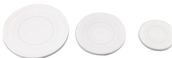
Non-slip silicone plate covers