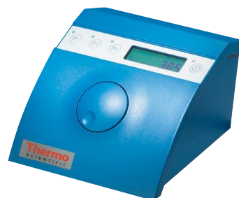
Cimarec i Telemodul 40C and 20C Controller