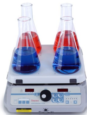
Super-Nuova Multi-Position Digital Stirrer

Certifications: cCSAus (all models), CE (220-240V models)