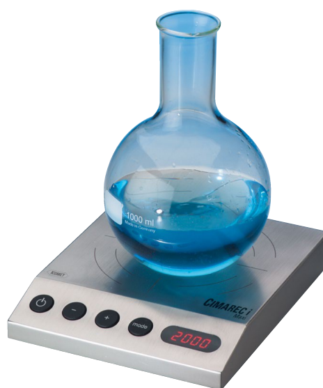
Cimarec i Maxi Direct Stirrer

Operating Conditions: -10° to +40°C at 95% RH. 100-240V units contain a cord set with various plugs.