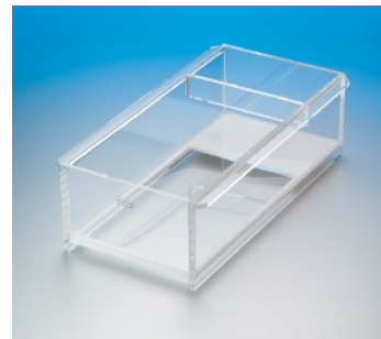
Cimarec i Bath Mounts