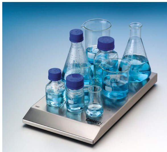
Cimarec i Telesystem Multipoint Stirrer

Operating conditions: -10° to +56°C at 100% RH in air; 0° to 50°C submerged in water. 100-240 V units contain a cord set with various plugs