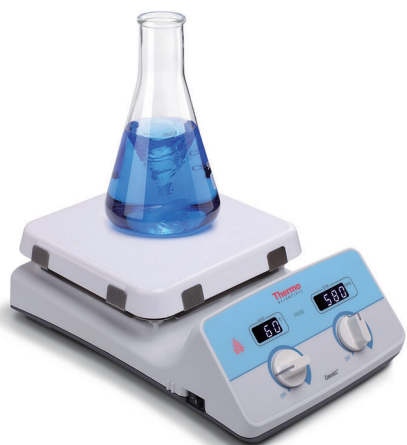
Cimarec + Stirring Hotplate

Please read all the information in this manual before operating the unit.