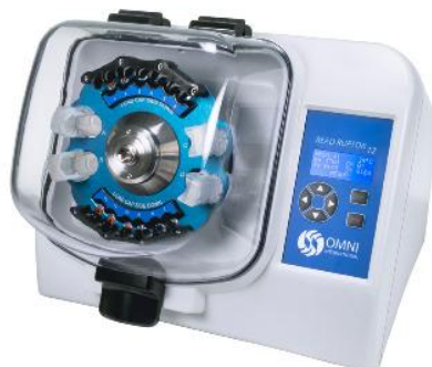
Bead Ruptor 12