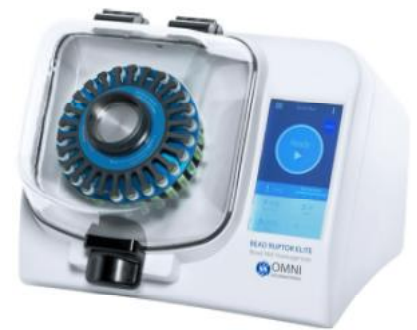
Bead Ruptor 24 ELITE