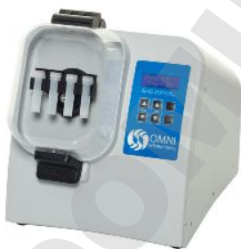
Bead Ruptor 4