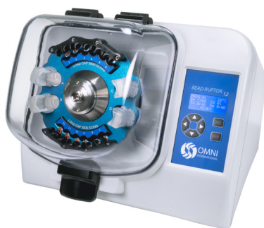
Bead Ruptor™ 12