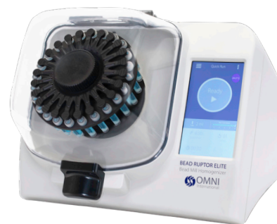
Bead Ruptor™ ELITE