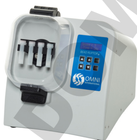
Bead Ruptor™ 4