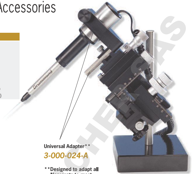
Universal Adapter** 3-000-024-A

**Designed to adapt all Nanojects to most micromanipulators and stereotaxic equipment – supplied with all nanojects