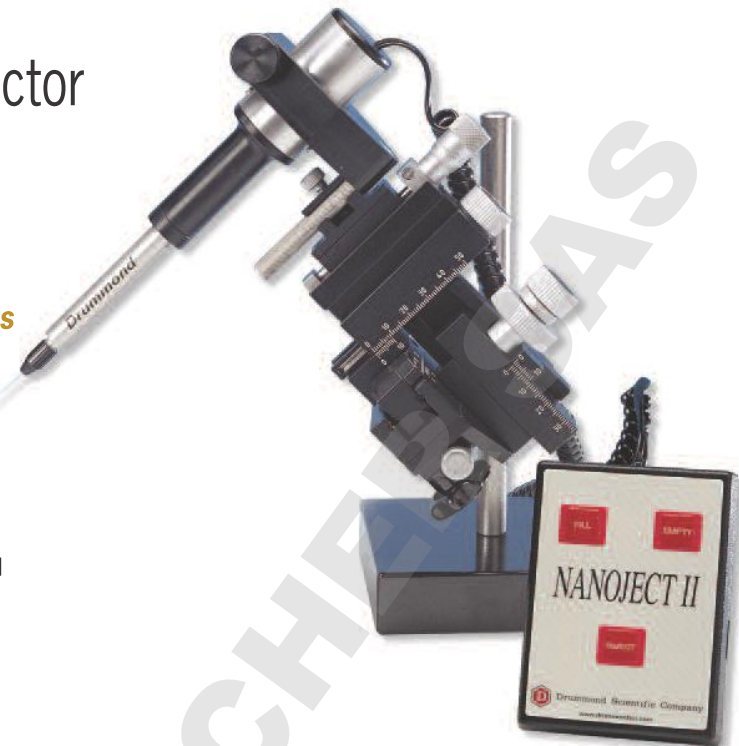
Power Supply with Universal Adapters

Each Nanoject II Auto-Nanoliter Injector comes complete with 200 borosilicate capillaries that can be pulled to the required tolerance together with a backfilling* needle and O-ring kit.