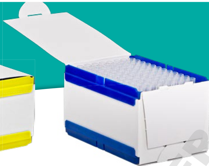
clearKnights, 200 µl, DP