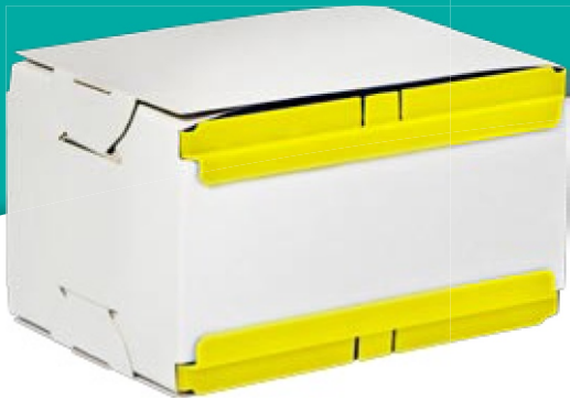
clearKnights, 50 µl, DP