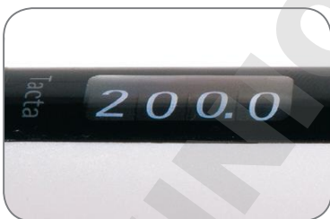
The volume is easy to read even when the pipette is angled.

The large, easy-to-read display helps you to see all four digits of the set volume from a distance without straining your eyes. The volume is easy to read even when the pipette is angled – eliminating the need to turn your head into an uncomfortable position.