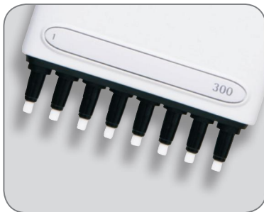
Safe-Cone Filters protect the pipette from contamination.

The exchangeable Safe-Cone Filters, used in pipette tip cones, act as barriers to prevent sample aerosols and fluids from contaminating the internal components of the pipette.