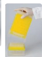
The rack snaps into place.