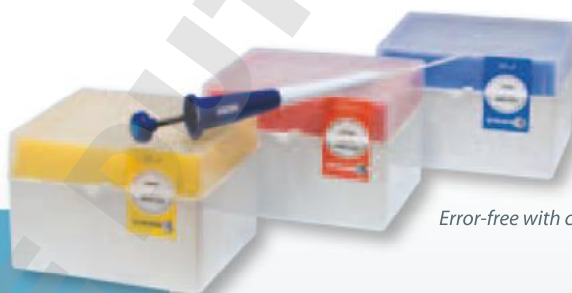
Error-free with color-coded racks

Full traceability thanks to the batch identification number