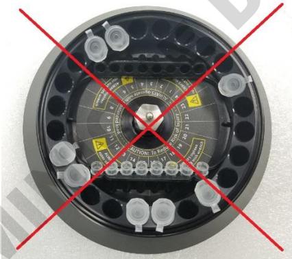
Figure 1. Loading the rotor to achieve balance