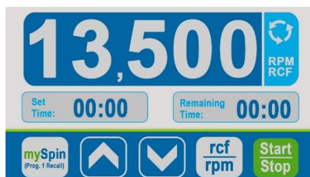
Figure 2. MC-24 Touch™ control panel layout

To store your settings, press “set” until no values are flashing, then press “home”.