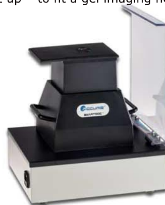
Accuris™ UV transilluminator shown with optional SmartDoc™ enclosure for smart phone imaging

Ethidium Bromide SmartGlow™ LD and PS Gel Red™ Gel Green™ SYBR® Green SYBR® Safe Diamond™ Nucleic Acid Dye