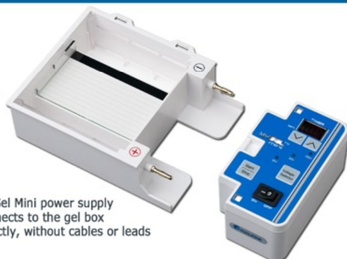
myGel Mini power supply connects to the gel box directly, without cables or leads