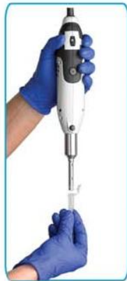
Ergonomic, "Slim-line" handle design