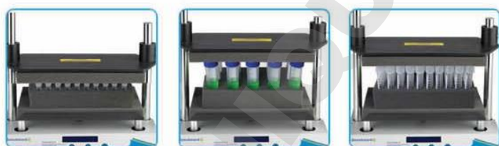
50 x 1.5/2.0ml