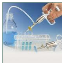
Filtration at your nozzle tip