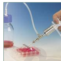
Aspiration with reverse modulus valve