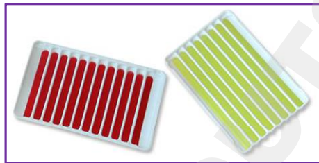
8- and 12-channel