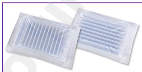
Single wrapped packaging