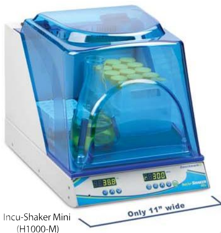
Incu-Shaker Mini (H1000-M)

Temperature, shaking speed and run time are displayed on the large LED control panel located on the front of the unit. The integral microprocessor includes a constant monitoring system that verifies and maintains accuracy through the duration of the program. Sophisticated over-temperature and over-speed controls ensure long life, safety and sample integrity.