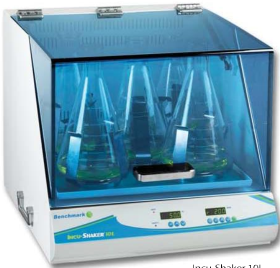
Incu-Shaker 10L (H1010)

The new Incu-Shaker™ series of shaking incubators provide digitally regulated temperature with precisely controlled, circular (orbital) mixing, optimized for the culture of a wide variety of cell types.