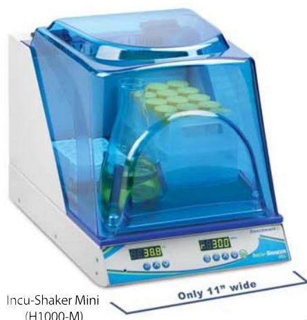
Incu-Shaker Mini (H1000-M)

Temperature, shaking speed and run time are displayed on the large LED control panel located on the front of the unit. The integral microprocessor includes a constant monitoring system that verifies and maintains accuracy through the duration of the program. Sophisticated over-temperature and over-speed controls ensure long life, safety and sample integrity.