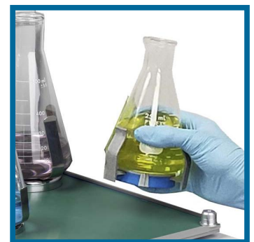
MAGic Clamp Platform H1000-MR with Adjustable MAGIC Clamp (H1000-MR-CMB)