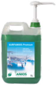
Surfanios Premium 5 L Can

Detergent disinfectant for floors and surfaces