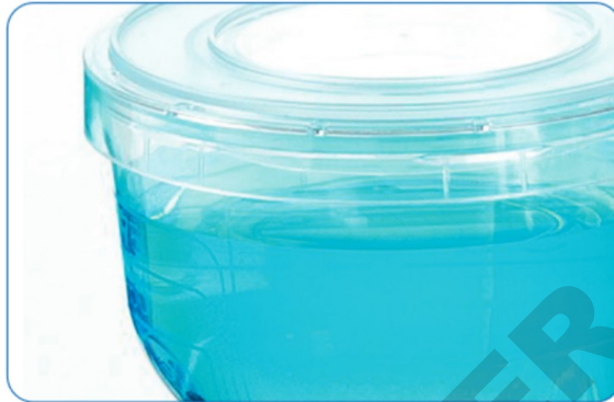
Vented lid on the device during filtration

Units can be stacked to save space in the work area