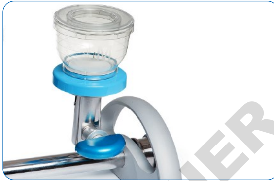
The EZ-Fit® filtration unit fits perfectly to the manifold