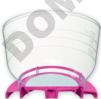
Funnel design minimizes residual liquid and prevents sample by-pass

The EZ-Fit® filtration unit conform to international standards (EP/USP/ISO standards) and comply with water testing regulations.