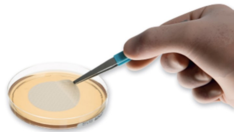
Drain support ensures membrane shape for perfect contact with media and optimal microbial recovery