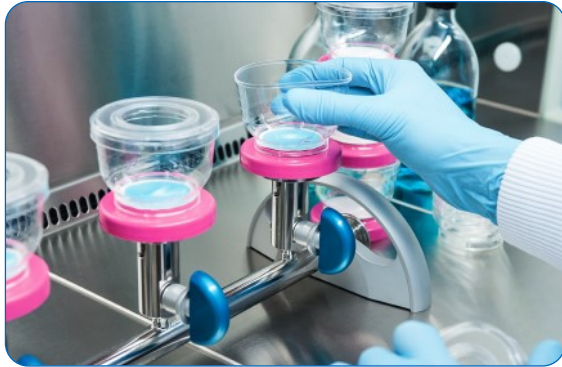
One handed funnel removal

Quick-fit connections for the vacuum tubing and a low manifold level make sterile filtration more convenient than ever before. The special filtration head for fitting the EZ-Fit® Filtration Unit allows the funnel to be removed with only one hand. The EZ-Fit® manifold's interior is easy to access for cleaning, so you can be confident that every filtration process is contamination-free. Each component can be removed by hand and autoclaved.