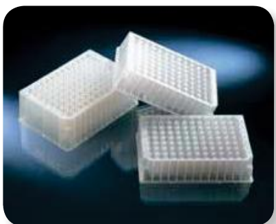
Nunc round-well plates