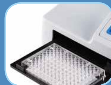
Robot-friendly plate carrier for both 96- and 384-well plates