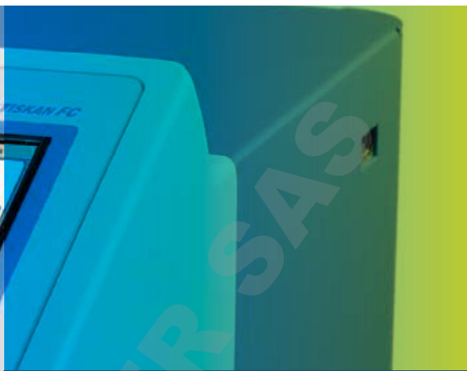
Thermo Scientific Multiskan FC Microplate Photometer