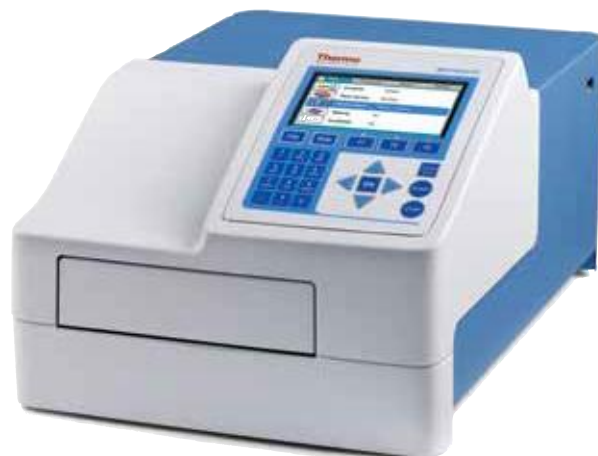
Multiskan FC microplate photometer

The large color screen of the Multiskan FC, combined with the simple and logical internal software, ensures easy and intuitive assay setup. The 'quick keys' allow instant access to the most commonly used protocols in routine laboratories. In addition, the internal software contains both qualitative and quantitative calculations for single, dual and kinetic measurements providing flexible data handling capabilities.