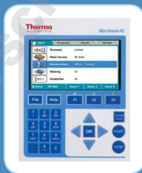
Large color screen and visual internal software

Applications: Immunoassays (ELISA), protein assays, endotoxins, cytotoxicity and proliferation assays, enzyme assays and growth curves