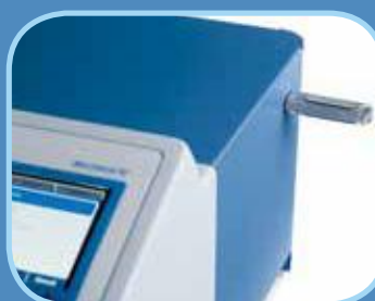
USB port for easy data transfer

Applications: Immunoassays (ELISA), protein assays, endotoxins, cytotoxicity and proliferation assays, enzyme assays and growth curves