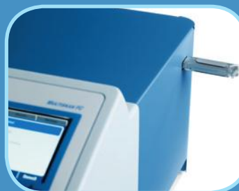
USB port for easy data transfer

Applications: Immunoassays (ELISA), protein assays, endotoxins, cytotoxicity and proliferation assays, enzyme assays and growth curves