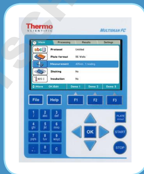
Large color screen and visual internal software

Applications: Immunoassays (ELISA), protein assays, endotoxins, cytotoxicity and proliferation assays, enzyme assays and growth curves