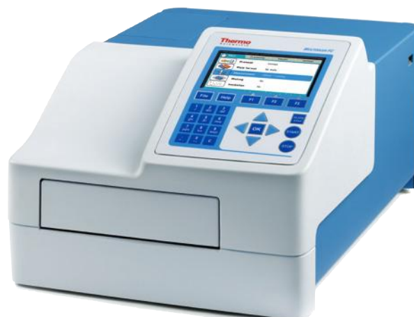
Multiskan FC microplate photometer

The large color screen of the Multiskan FC, combined with the simple and logical internal software, ensures easy and intuitive assay setup. The 'quick keys' allow instant access to the most commonly used protocols in routine laboratories. In addition, the internal software contains both qualitative and quantitative calculations for single, dual and kinetic measurements providing flexible data handling capabilities.