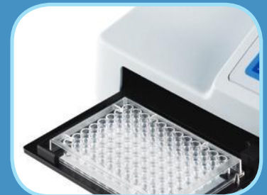
Robot-friendly plate carrier for both 96- and 384-well plates