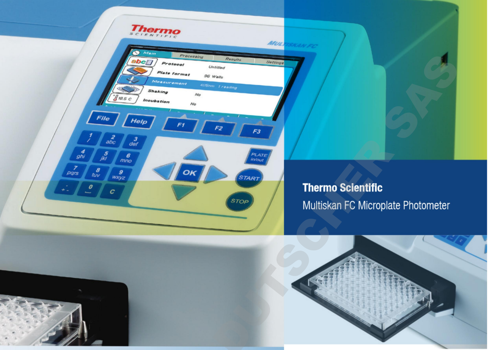
Thermo Scientific Multiskan FC Microplate Photometer