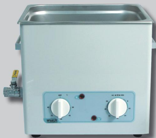
WUC-A06H with lid and valve