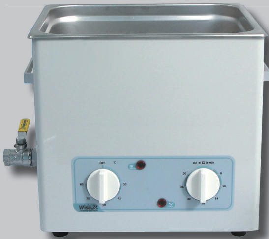
WUC-A06H with lid and valve