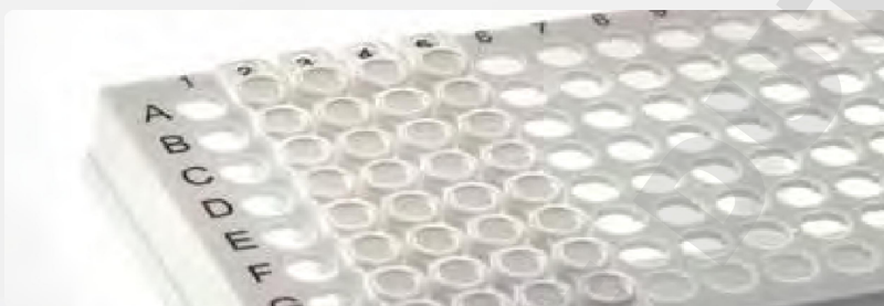
4ti-0757-F Universal fully skirted plate