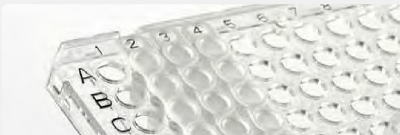
4ti-0910-F Vari-Strip™ FastBlock frame for ABI Fast Block