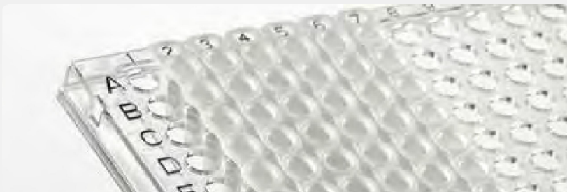
4ti-0950-F Vari-Strip™ 480/96 frame for Roche LightCycler 480