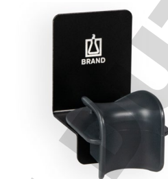
Wall mount for 1 Transferpette® S single- or multi-channel pipette.