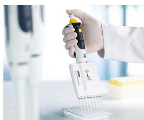
Working with PCR plates