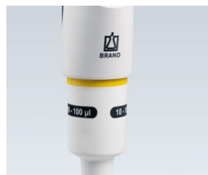
Integrated shaft coupling