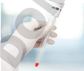
Narrow centrifuge tubes