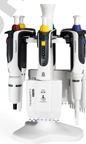
Bench top rack for 6 Transferpette® S single- or multi-channel pipettes.