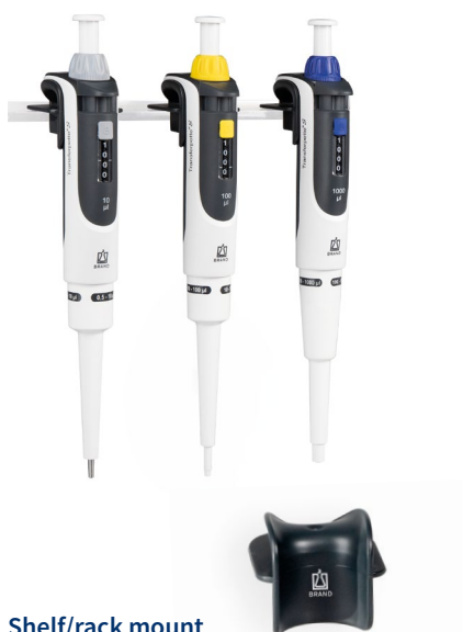
Shelf/rack mount for 1 Transferpette® S single- or multi-channel pipette.

With holders and stands, the devices are always properly stored and close at hand for the next application.