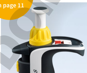
Easy Calibration technology