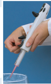
Dispenser tip ejection