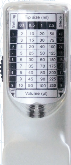
Volume table HandyStep® S with PD-Tips II

The double-sided volume table on the back side shows all the necessary stroke setting information at a glance.