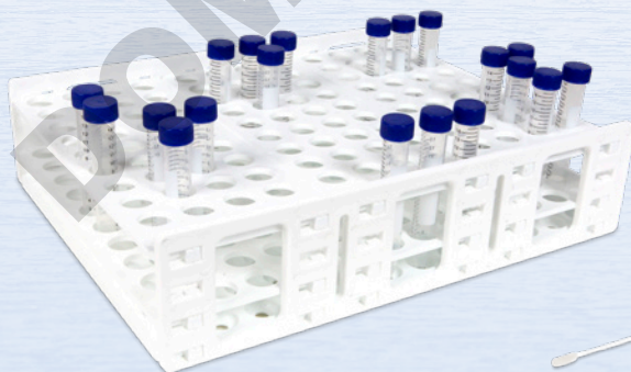
120834 & 120835

Ideal footprint for use with programmable tube filling machines