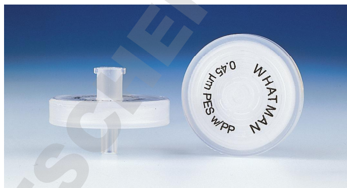
Fig 1. 25 mm diameter GD/XP Syringe Filters are outstanding for inorganic ion analysis