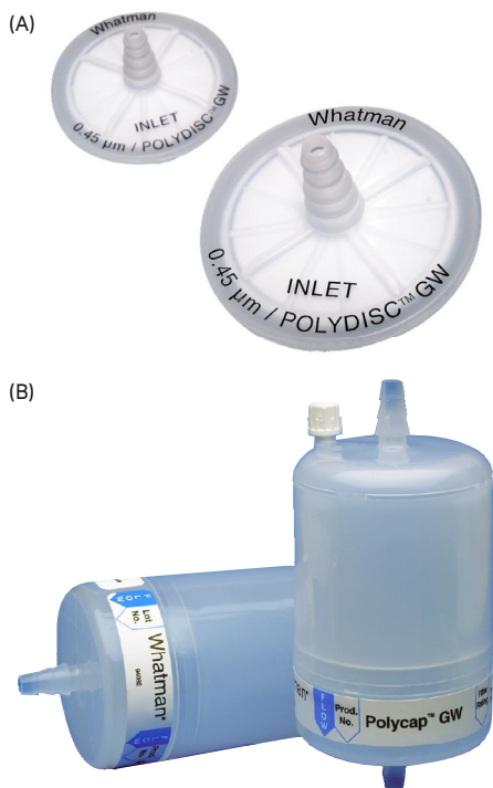
Fig 3. (A) Polydisc GW has a filtration area of 20.4 cm 2 . (B) Polycap GW is larger with a filtration area of 600 cm 2 .

Polydisc GW and Polycap GW have been developed for the preparation of larger volumes of groundwater samples for the analysis of dissolved heavy metals. The Polydisc GW and Polycap GW feature a stepped hose barb connection on the inlet and outlet for easy fitting with various tube sizes.