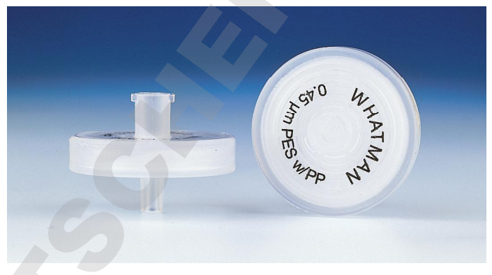
Fig 1. 25 mm diameter GD/XP Syringe Filters are outstanding for inorganic ion analysis