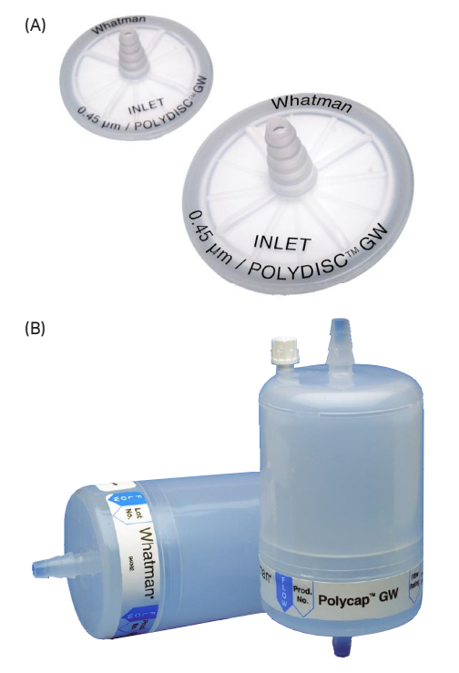
Fig 3. (A) Polydisc GW has a filtration area of 20.4 \rm cm^2 . (B) Polycap GW is larger with a filtration area of 600 \rm cm^2 .

Polydisc GW and Polycap GW have been developed for the preparation of larger volumes of groundwater samples for the analysis of dissolved heavy metals. The Polydisc GW and Polycap GW feature a stepped hose barb connection on the inlet and outlet for easy fitting with various tube sizes.