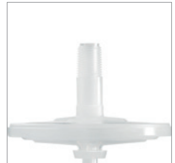
1/8" NPT Thread