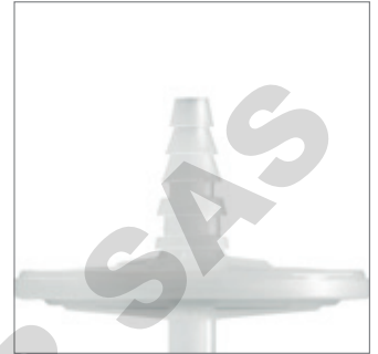
Standard Hose Barb