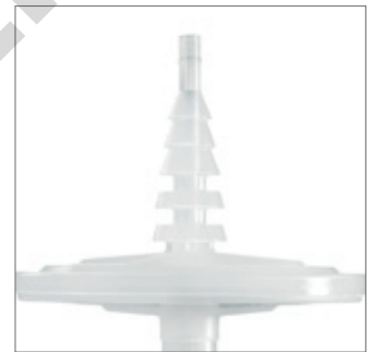
Small Hose Barb