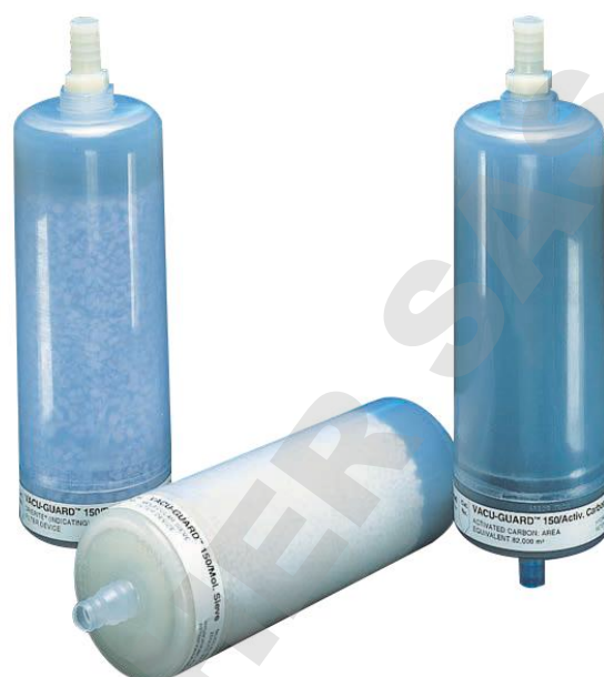
Fig 2. In-line capsule filters trap chemicals in addition to aqueous aerosols.