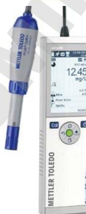
S3 Conductivity Routine Meter