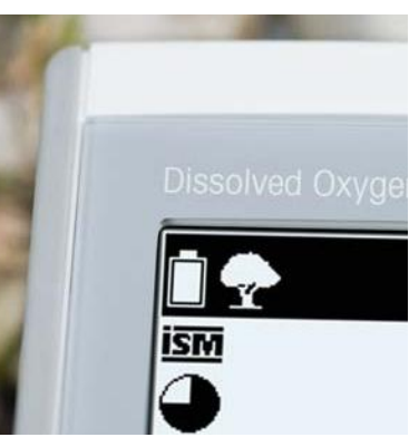
Outdoor Mode – Maximize Battery Life

The outdoor user mode, which comes in addition to the routine and expert laboratory modes, provides users with default instrument settings (e.g. screen brightness sleep mode, and auto-shutdown) that ensure the Seven2Go portable's battery lasts, even if the nearest AA batteries are miles away.