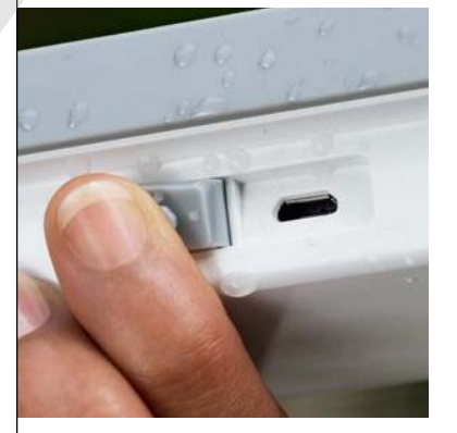
Thanks to its IP67 protection and drop test resistance, the new Seven2Go portables are able to withstand harsh and demanding environments. The weatherproof USB connector ensures data can be transferred safely even after the meter has been exposed to heaps of water.