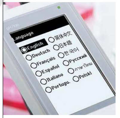
Seven2Go's new intuitive menu guarantees out-of-the-box operation for anyone. Users no longer need to study lengthy operating instructions. A brief look at the graphical QuickGuide and the instrument is installed and ready for calibration and actual measurement.