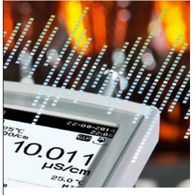
Endpoint Signaling – Attend to Your Measurement

Visual and accoustic signals can be setup to announce warnings, button presses or end-point stability, allowing you to focus your eyes on your ongoing measurement, sample handling, or the moving product line.