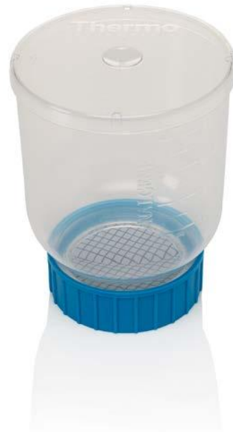
Nalgene Analytical Test Filter Funnel

Nalgene Water Quality Membranes (Cat. No. DS0205-6045) and Nalgene Analytical Test Filter Funnels 100mL (Cat. No. 147-0045) and 250mL (Cat. No. 147-2045), Oxoid Legionella CYE Agar Base (Cat. No. CM0655) and growth supplements can be used in the growth and enumeration of Legionella in water quality testing according to the ISO 11731 standard. The black membranes are superior because of the contrast of their color to the white colonies of Legionella and should be considered when establishing protocols for water quality testing.