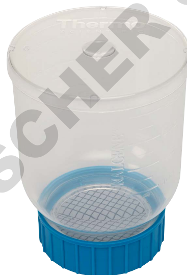
Thermo Scientific™ Nalgene™ Analytical Filter Funnel

Filtration is a common practice in water quality and/or food and beverage testing. The critical considerations when establishing a filtration protocol are flow rate of the liquid tested and microbial recovery rate.