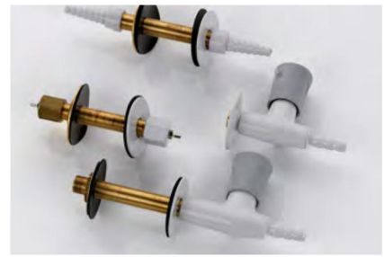
Side wall service taps are easy to install