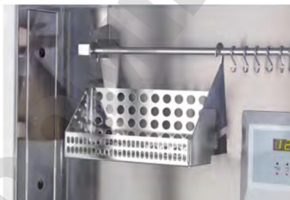
Utility basket with hanging bar increases flexibility of the working area and helps improve organisation