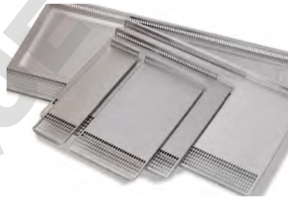
Configurable work surface improves flexibility of the working area