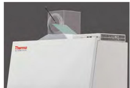
Direct duct exhaust can be added when working with trace amounts of volatile chemicals