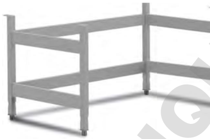
Manually adjustable stand enables cabinet to be set at a comfortable working position between 750-950mm