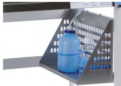
SmartPort floor stand hanging shelf to keep area beneath cabinet clear to ensure adequate legroom for a comfortable working position